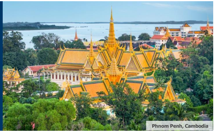
Phnom Penh, Cambodia

7-night river cruise from Kampong Cham to My Tho September 23-30, 2024 | AmaDara