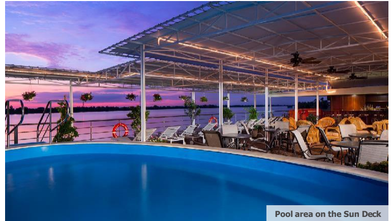
Pool area on the Sun Deck