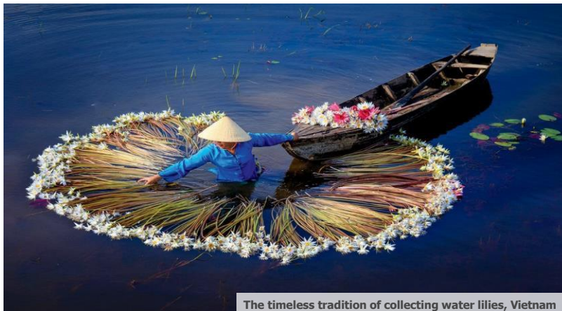
The timeless tradition of collecting water lilies, Vietnam